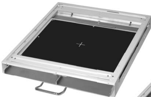
Shown with QUEST Cassette Tray (Q-1717CT) & Cassette Sold Separately