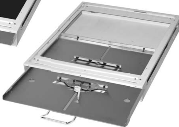
Shown with QUEST Cassette Tray (Q-1717CT) Sold Separately