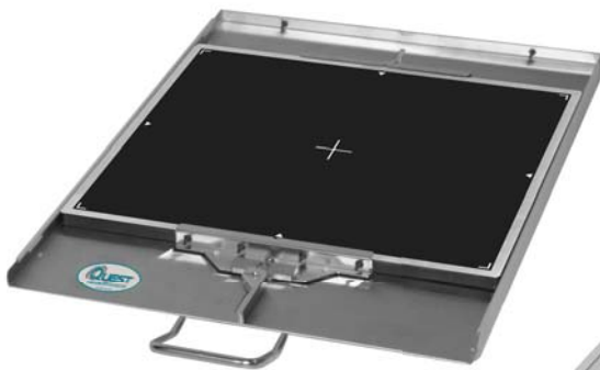
Shown with CR Cassette